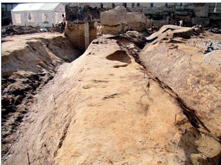
Ditch of a site of ancient settlement on the Okhta Cape and a ditch with a 13th century paling.

of view. As it has turned out, the settlements of the Neolithic are separated from the overlying medieval soil layers by sand drifts up to 1 m thick, and scientists referred them to the time of the Neva origin. According to paleogeographers, it appeared about 3,100 years ago as a result of breaking through of water from the Lake Ladoga to the Gulf of Finland. Our findings testify that approximately 2,800 years ago people returned to this locality. The studies of the central part of the Okhta Cape revealed traces of man's stay there in the Bronze age* and also in early Iron age**, which was proved by the remnants of bonfires and artifacts (800 B.C.–500 A.D.).