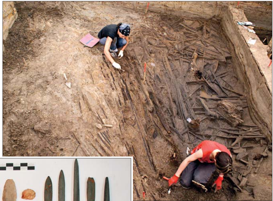
Excavations of wooden structures of the Neolithic.