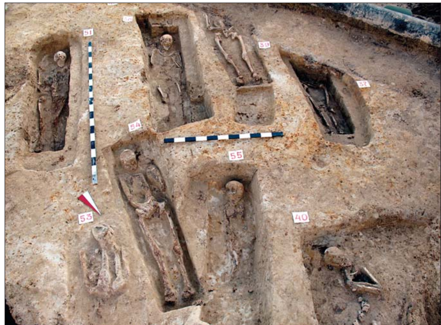
Burials from the burial ground on the left bank of the Okhta.

pieces, others were bound hand and foot and taken away from the town, and the town was burnt down and destroyed”. (These and subsequent events are described in detail in the monograph by the author of this article “Landskrona, the Neva Mouth, Nyenschantz”, Litera Publishers, St. Petersburg, 2000.)