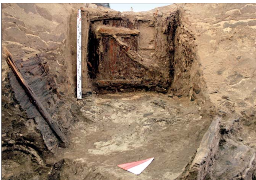
Secret passage in a flank of the Myortvy Bastion.

tions were constructed in the 17th century, and another part was damaged by modern engineering services and constructions. The backfilled ditches reveal, as archeologists say, redeposited human bones in large quantities related to approximately 300 destroyed burials. On the preserved parts of the cemetery numerous graves overlap each other in two or three layers. The buried lay on the back with crossed arms, partly in coffins, of which there remained log decay and forged nails. Their heads were oriented mainly to the southwest and, occasionally, to the northeast and northwest. There were found two group burials, which probably were attributed to military activities as the dead were placed in a row on a wooden flooring. Lead bullets were found among the human bones in five graves.