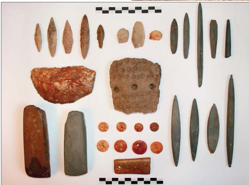
Findings of the Neolithic and early metal age: stone implements, ceramics, amber decorations.

2010 this idea was renounced). A territory with a total area of about 30,000 m 2 was studied during that period. Archeologists were surprised to find a monument under the factory buildings demolished in 2007, unique not only for Russia but also for the whole of North-Eastern Europe. In beddings up to 5 m thick cultural layers and objects were discovered, which were widely separated in time, namely, sites of the Neolithic and early metal age, a site of medieval settlement on the Okhta Cape, the 13th century Landskrona fortress, a late medieval burial ground of Nevskoye Ustye, a Russian settlement of the 16th-17th centuries, and the 17th century Nyenschantz fortress. Each of them will be discussed below.