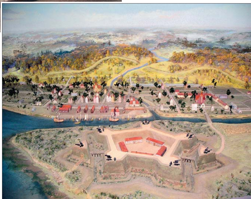
Mock-up of Nyenschantz fortress and the town of Nyen at the museum "Landskrona, the Neva Mouth, Nyenschantz", 2003-2007.

middle of the 20th century and disappeared completely from the urban landscape only when new buildings of the Petrozavod enterprise were built in the 1970s. Taking into account ever-growing compact industrial planning of this territory, many historians were of the opinion that no traces of ancient monuments remained there.